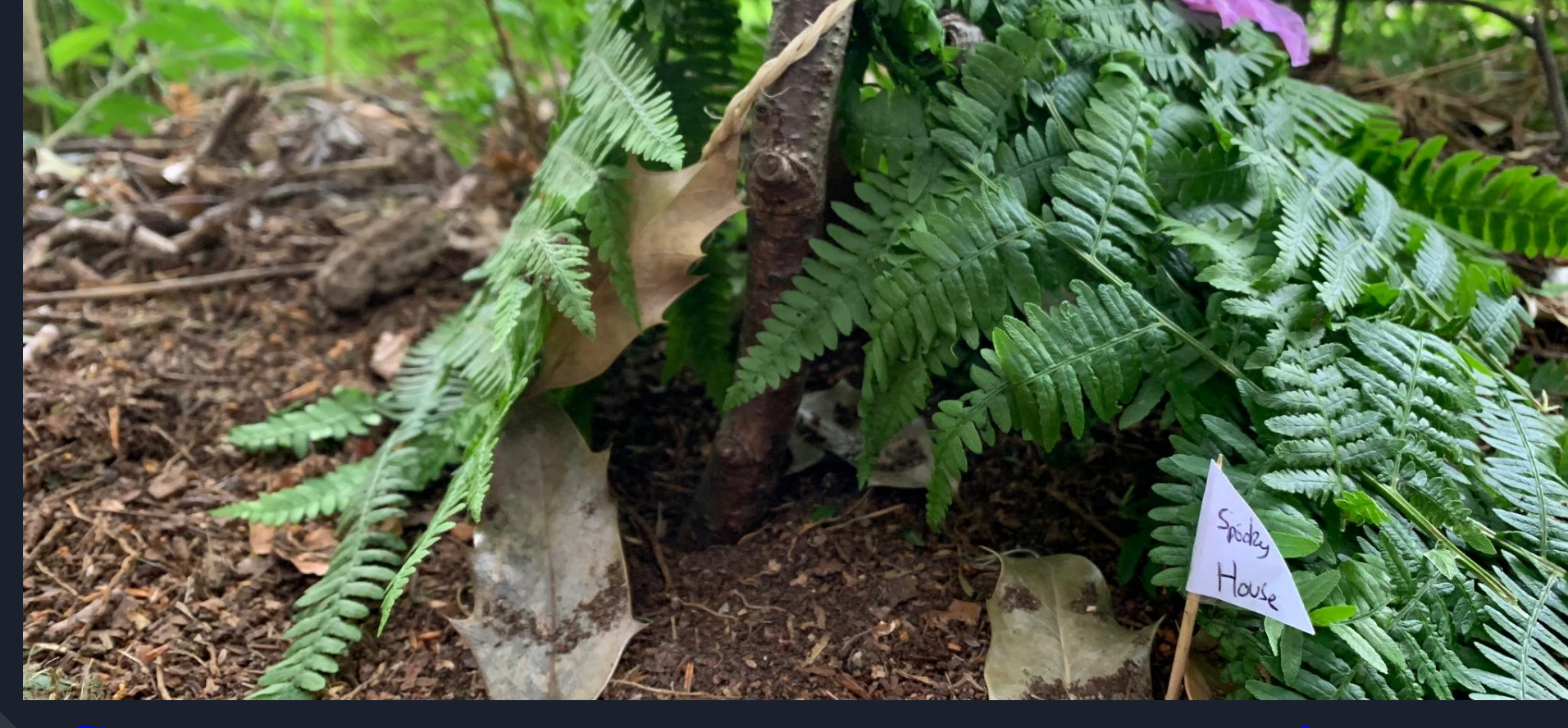
This is a spooky house and as you can see there is a number of ghosts hanging from the ceiling and floor.