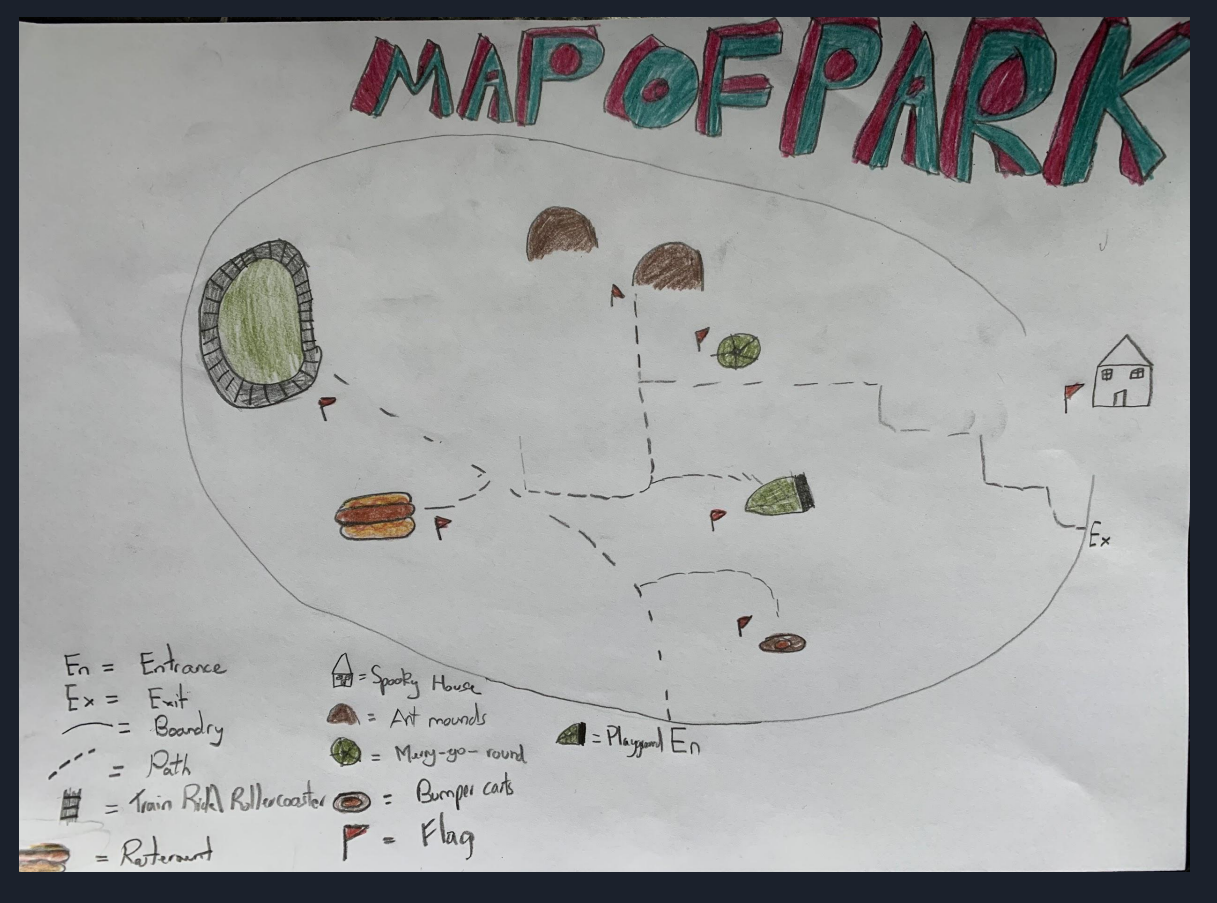
Here is a map we created of our anty land!