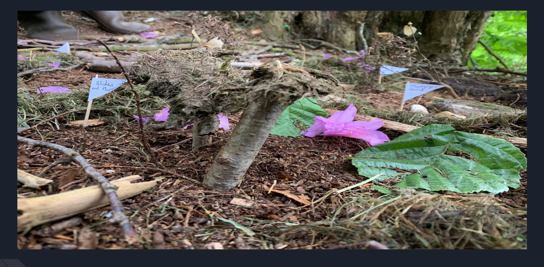
This is the ant playground where ant children can have fun.