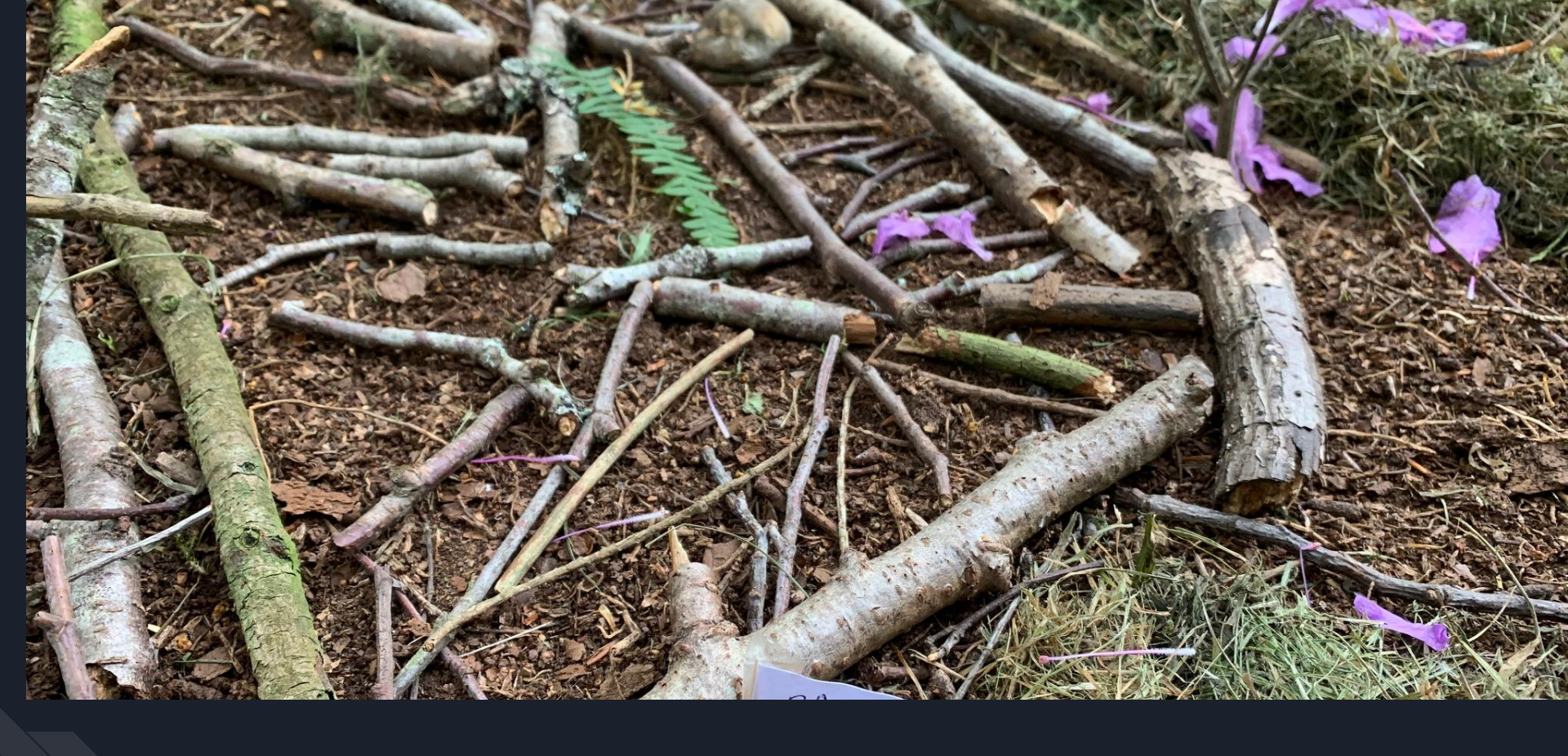
This is the awesome train ride that Bea created and loves!