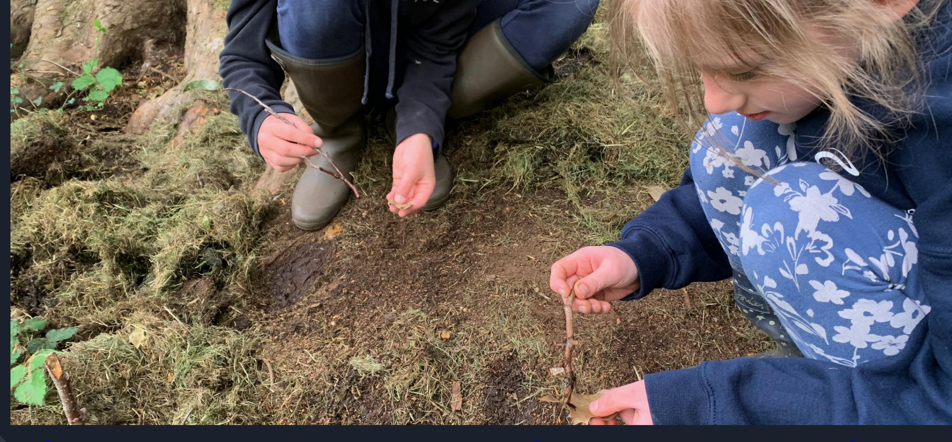
In this picture we are making the ghosts for the spooky house out of mud, holly and dirt.