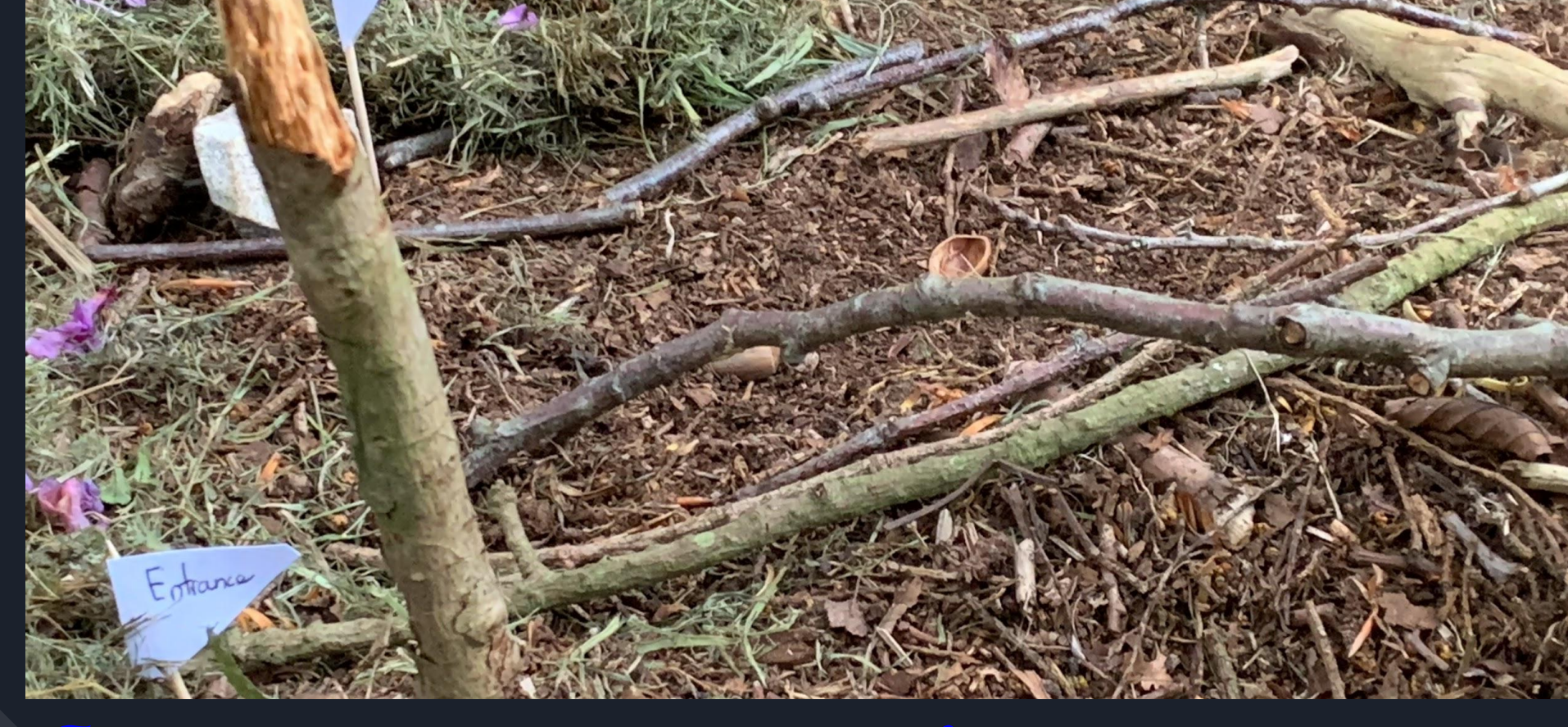
This is the bumper cars where ants can have fun bumping around in acorn cars!