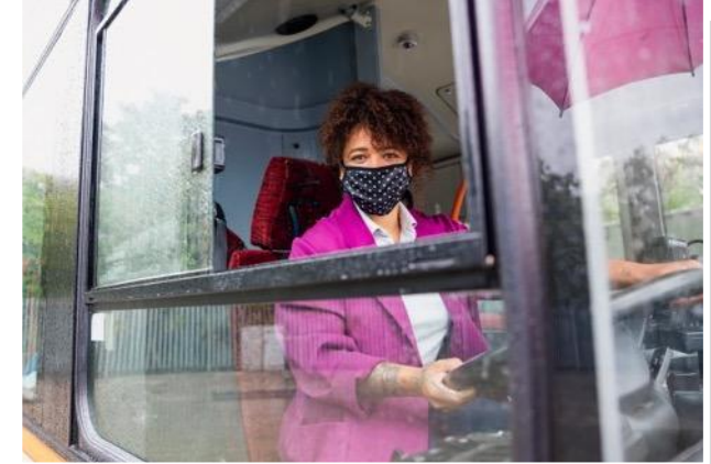
Public transport workers